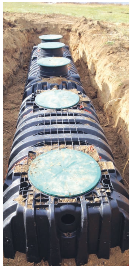
Giant Goose Ranch IM-Tanks Installed

NSF350 water recycling membrane systems were designed to meet the challenges of this project. The 500 or 1000 GPD units feature Bio-Microbics BioBarrier Membrane (MBR) systems installed within Infiltrator IMTM-Series Tanks.