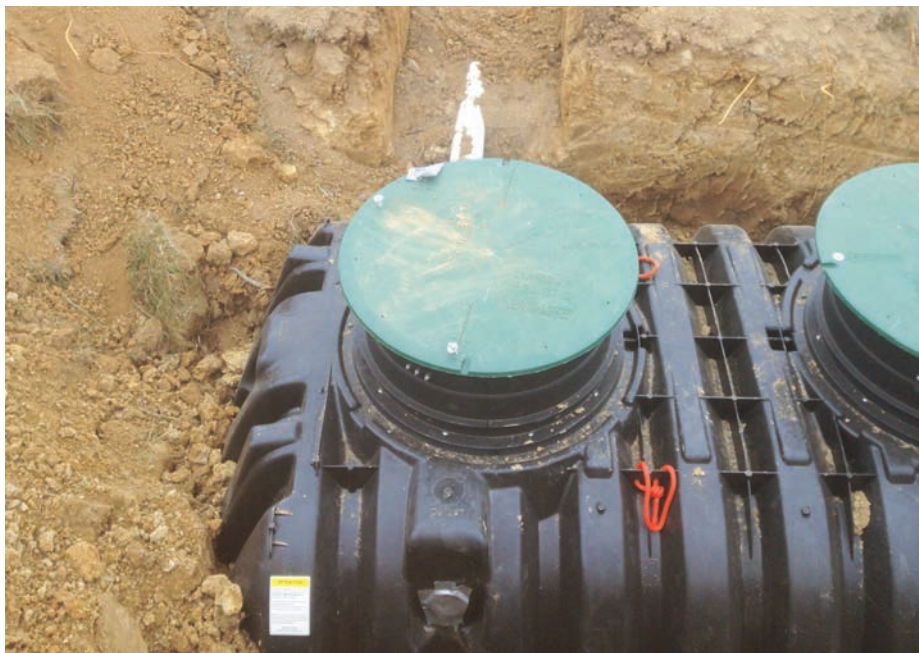
Giant Goose Ranch IM-Tanks and EZflow

A BioMicrobics panel controls the MBR systems and the lift stations are monitored via an Aquaworx by Infiltrator IPC Control Panel. The ability to monitor the system 24/7 and download data via the Aquaworx IPC Control Panel allowed for system adjustments based on usage to increase