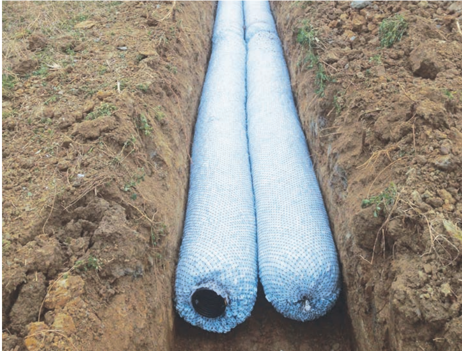
EZflow Dispersal Field Install

The numerous MBRs were built to suit the location with single units for individual cabins and 1000 GPD MBRs to serve clusters of resort cabins, beach houses, a store, and a banquet hall. Installing the MBRs in the lightweight plastic Infiltrator IM-Series Tanks allowed the units to be constructed in a shop to specifications and then delivered and installed around the property without requiring a heavy boom truck thus saving substantial expenses. The Infiltrator IM-Series tank specification was critical to the project's feasibility.