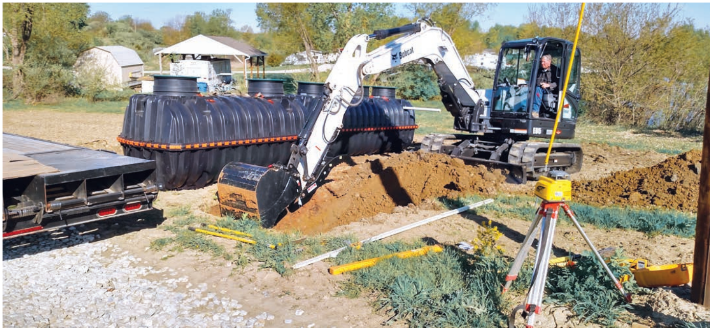
Giant Goose Ranch Excavating to Install IM-Tanks