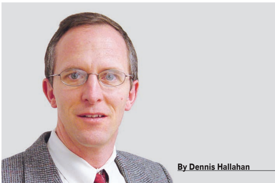
By Dennis Hallahan

The ability to monitor MBR system 24/7 and download data via Aquaworx IPC Control Panel allowed for system adjustments based on usage to increase efficiency and performance.